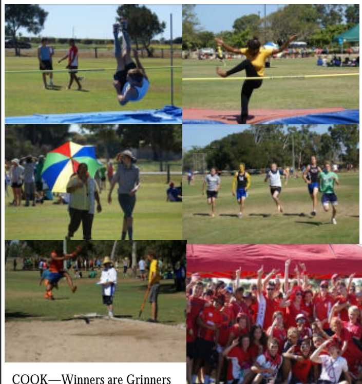
COOK—Winners are Grinners